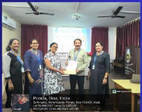
Ponda, Goa, India Cx4v+p5q, Donshiwado, Ponda, Goa 403401, India Lat 15.406933° Long 73.992549° 08/11/2025 10:54 AM GMT+05:30