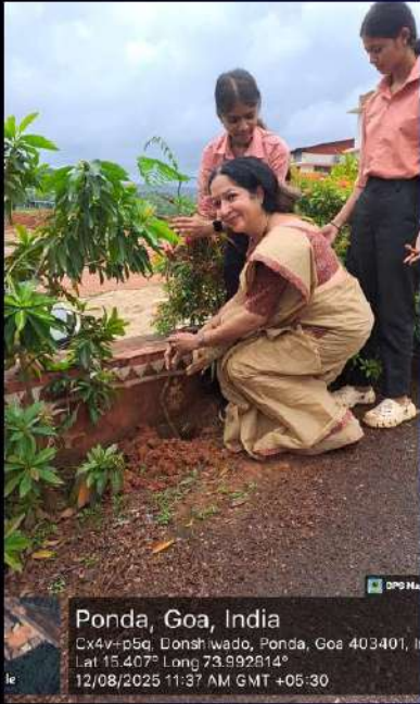
Ponda, Goa, India Cx4v+p5q, Donshiwado, Ponda, Goa 403401, India Lat 15.4077° Long 73.992814° 12/08/2025 11:37 AM GMT+05:30