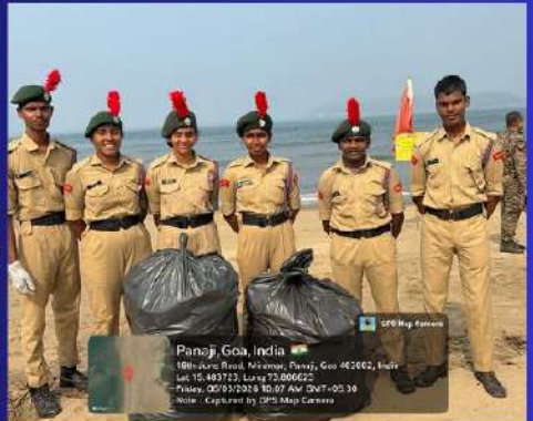
Panaji, Goa, India 10th June Road, Nivamar, Panaji, Goa 403002, India Lat 15.493723° Long 73.806622° Friday, 08/08/2025 10:47 AM GMT+05:30 Note: Captured by GPS Map Camera