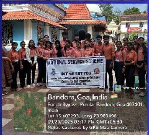
Bandora, Goa, India Ponda Bypass, Ponda, Bandora, Goa 403401, India Lat 15.407293° Long 73.983496° 09/20/2025 03:17 PM GMT+05:30 Note: Captured by GPS Map Camera