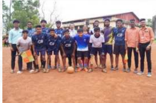
Runners up: TYBCom