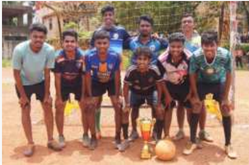
Winners: SYBCom C & D

The Department of Physical Education organised a football tournament from 14 th Aug to 17 Aug 2023. 13 Teams participated.